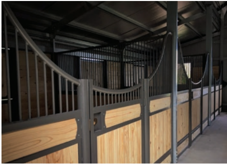
38mm Tongue & Groove fitted timber