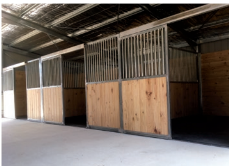
Raw Gal Steel Standard finish.