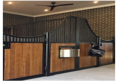
Stable feeder options

Big drink 6L stable waterer and 10L yard waterer. Strong troughs designed to take what horses dish out.