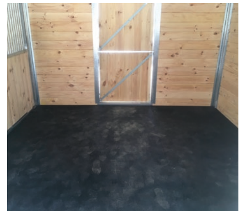
Stable Flooring No smell, easy clean and non-slip comfort.