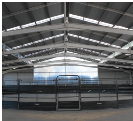
Horse Safe Skirted Rail