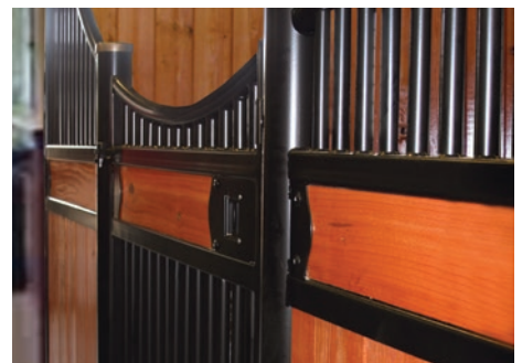
Horizontal Timer upgrade Decorative.

Adds steel protection as well as a beautiful finish in any colour. Great way to theme your barn.