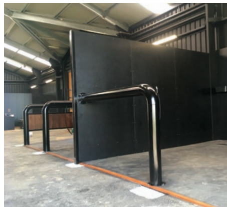
Wash Bays and Wet Areas Non-slip and won't rot. Easy to sweep clean.