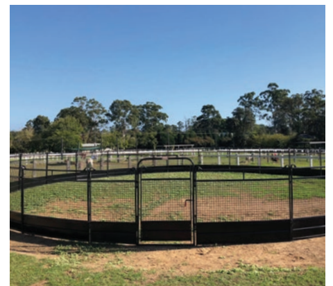
Horse Safe Mesh