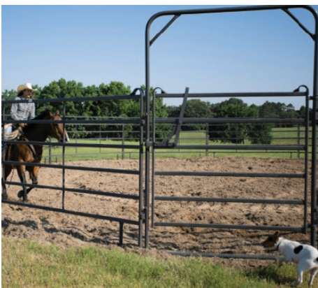
Premier 6ft high

Diameters – 12m, 15m, 18m, 21m, – All styles 6ft high (1.8m) – all powder coat protective finish.