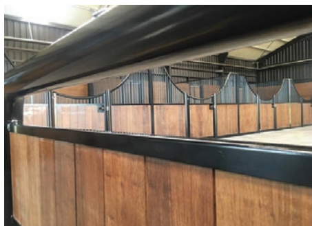
Powder Coat finish

Adds steel protection as well as a beautiful finish in any colour. Great way to theme your barn.