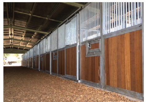
Hot Dip Gal steel

Priefert's High Density Polyethylene is like no other in that it has a custom blend of materials unique to Priefert to withstand brutal punishment from any horse.