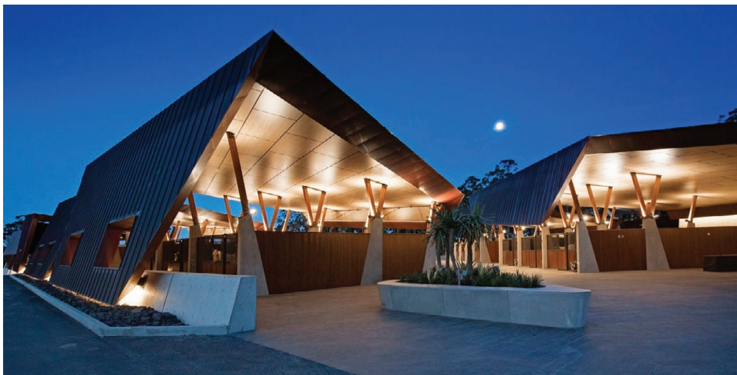
Willinga Park – Mr Terry Snow

When you purchase a Priefert Australia product, you are purchasing peace of mind that it will last and will be an asset to your barn and property.