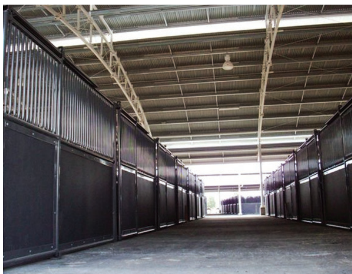
Premier Stables AELEC Tamworth

All products provided by Priefert Australia have been used, tested and must have ticked all the boxes demanded by the people at Priefert Australia and their customers.