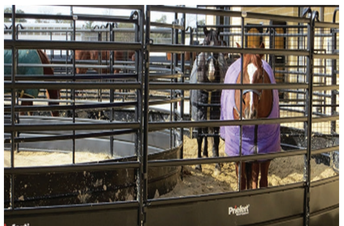
Technology Adaptable technology with the remote control, Planetary Gear Drive.