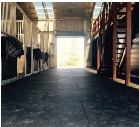
Breezeways and Walkways Non-slip even in the wet and noise reducing.