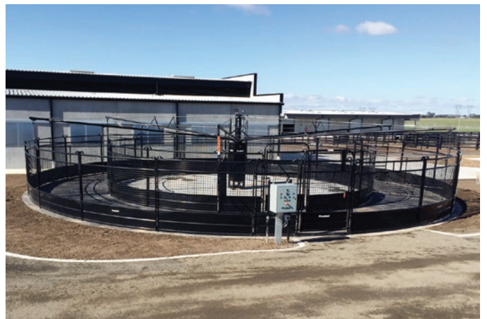
Proven The Australian Government Post Entry Quarantine facility.